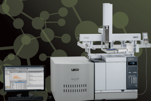
Pegasus® BT GC/MS